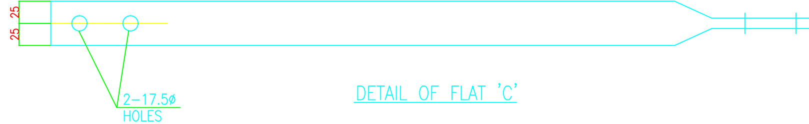
DETAIL OF FLAT 'C'