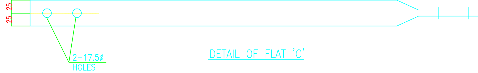
DETAIL OF FLAT 'C'